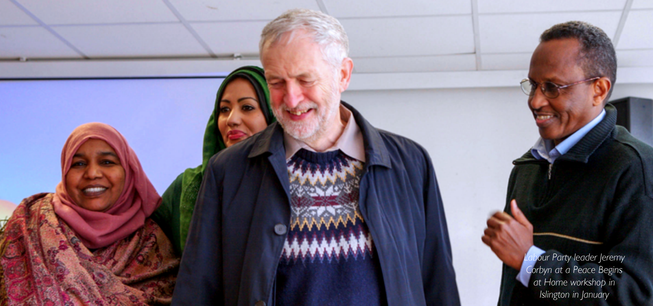
Labour Party leader Jeremy Corbyn at a Peace Begins at Home workshop in Islington in January